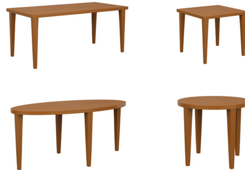
Occasional Table Collection