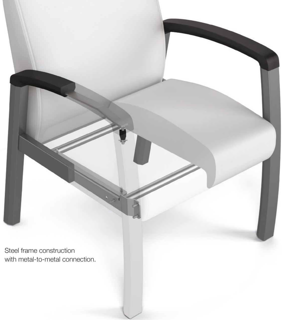
Steel frame construction with metal-to-metal connection.