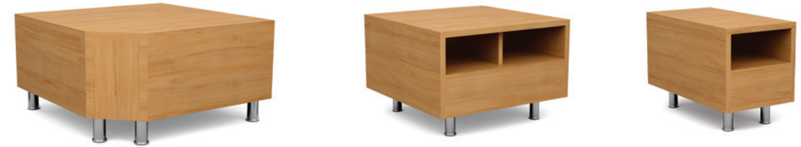
Cube Table Collection