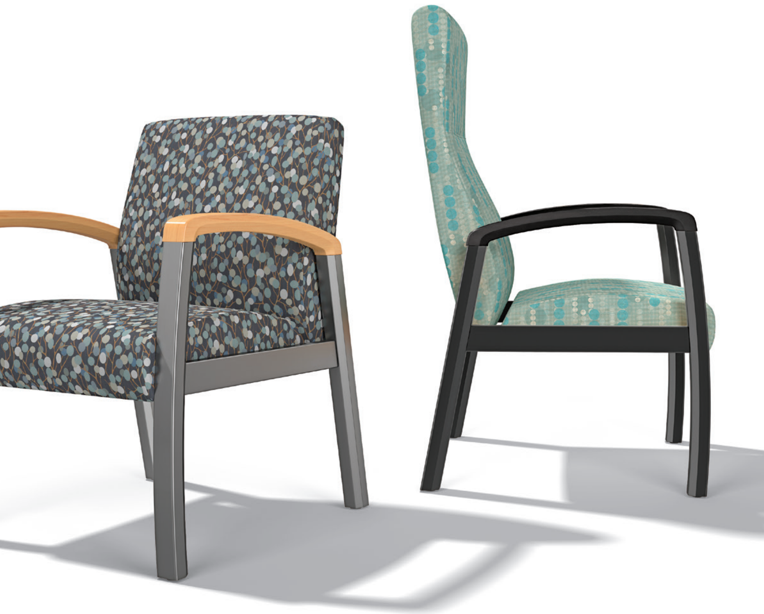
LEFT: Aviera guest chair, silver metallic metal frame, clear maple wood arm caps. TEXTILE: CF Stinson – Natural World, Nightshade. RIGHT: Aviera patient chair, graphite metal frame, polyurethane arm caps. TEXTILE: CF Stinson – Fizz, Bubbly.

Discover the only lounge furniture brand with a 10-day lead time promise. Our highly efficient production cycle means we can sync orders and avoid off-schedule shipments at a rate our competitors just can't match. From start to finish, we maximize efficiency in every single area—whether it's sourcing and logistics or assembly and production.