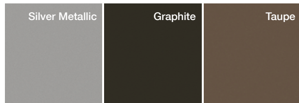
Table & Arm Cap Wood Finishes