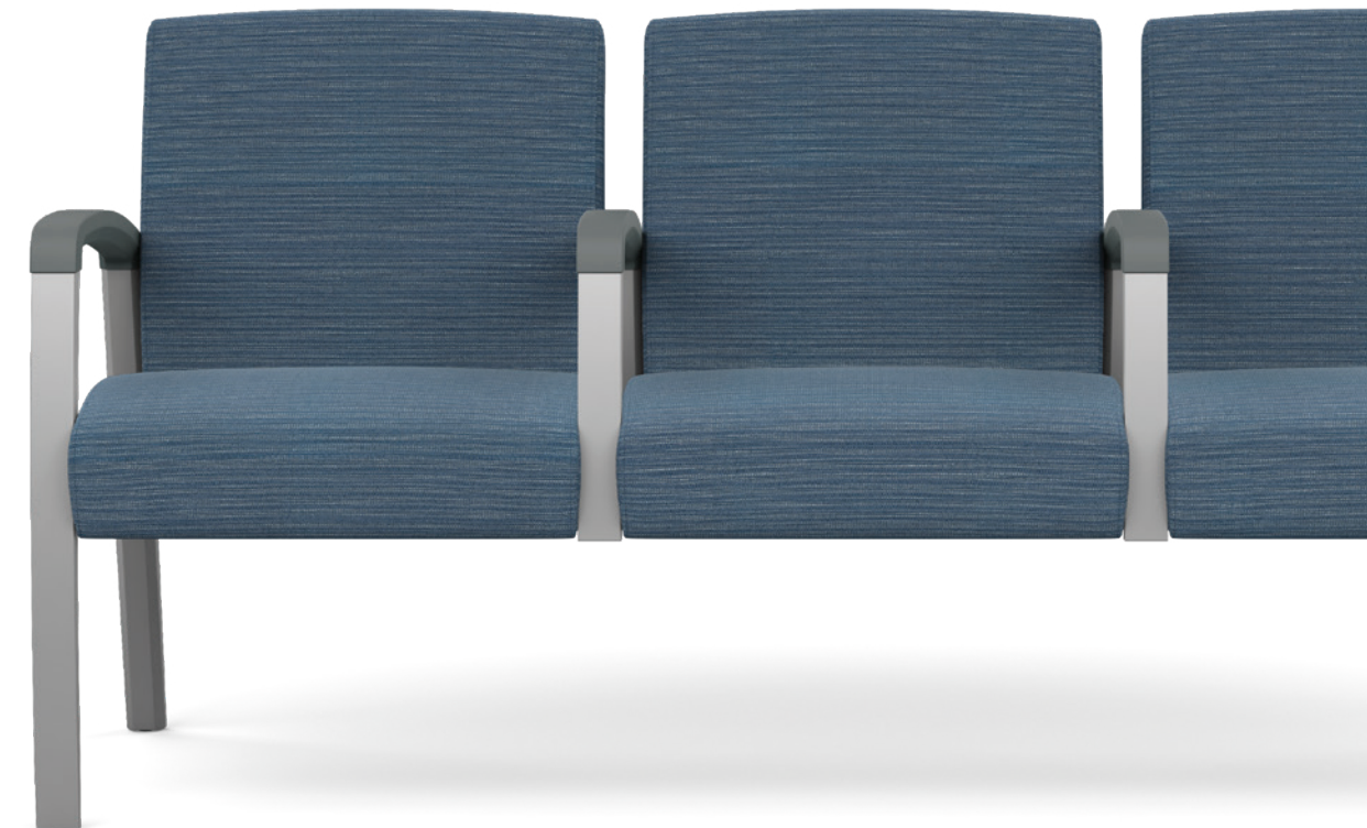
Aviera freespan three seat, silver metal frame, polyurethane arm caps. TEXTILE: DesignTex – Connor, Blue.