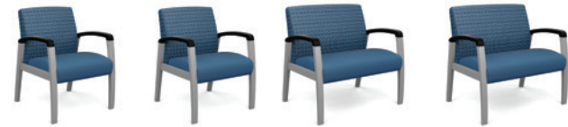
Guest 21" Guest 24" Guest 30" Guest 44"