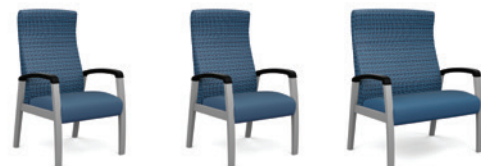
Patient 21" Patient 24" Patient 30"

* Yardage requirements for COM and COL are for solid and non-directional fabrics. Additional material may be required for larger repeating patterns. Contact Customer Support.