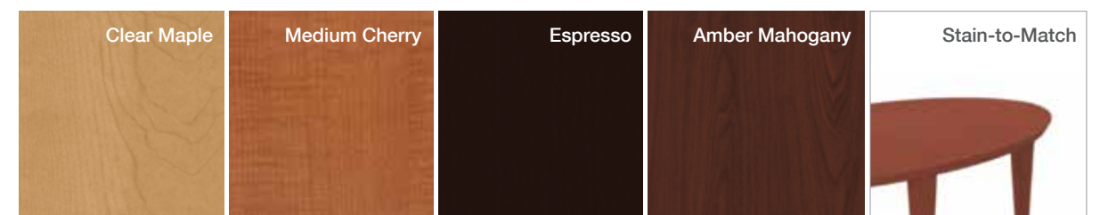
Table & Foot Wood Finishes