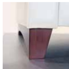
Wood Tapered Square with Side Rails