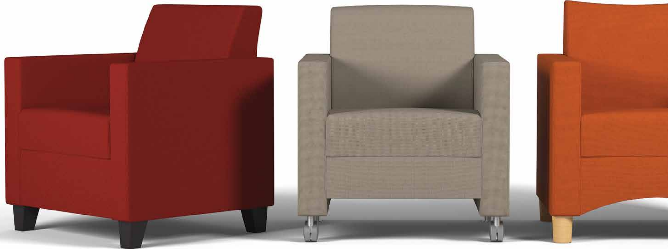
LEFT: Composium Sharp club, square back, full valance, wood tapered square feet in espresso finish. TEXTILE: Maharam – Manner, Ember. CENTER: Composium Sharp club, round back, 3/4 valance, non-locking caster wheels in silver finish. TEXTILE: Momentum – Odyssey, Rue. RIGHT: Composium Sharp club, scalloped back, arched valance, wood tapered cylinder feet in clear maple finish. TEXTILE: Momentum – Oath, Tango.

Modern and minimalist, Composium® Sharp delivers contemporary style. Choose from three back styles, four valance styles and 13 foot styles for the perfect look for corporate, hospitality and higher education settings. Just like you imagined.