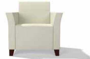
FLAIR Shown with square back and integrated valance.