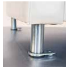
Metal 1.5" Pole Anchor, Brushed Steel