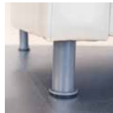
Metal 1.5" Pole, Silver Powder Coat