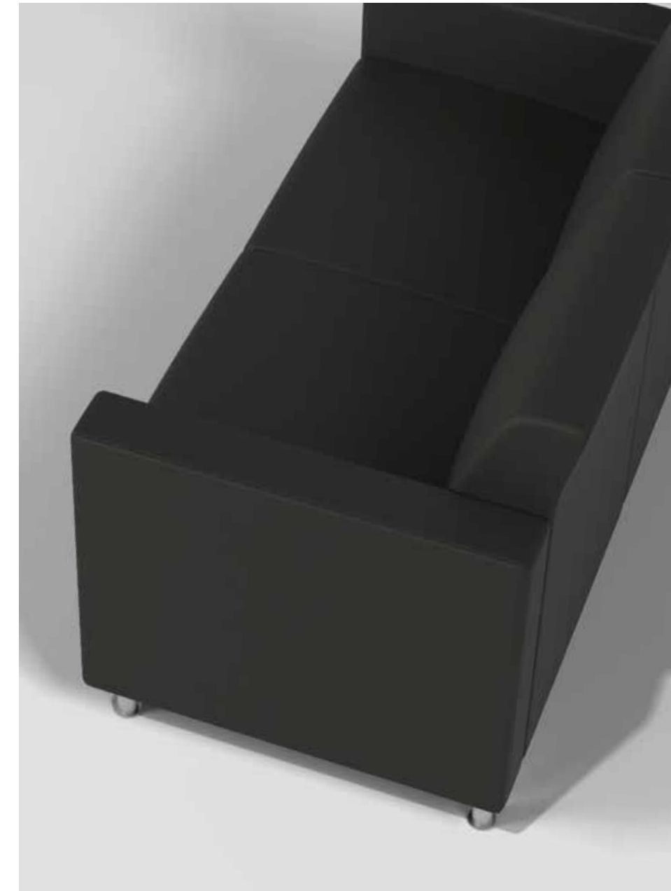
Composium Sharp settee, square back, 3/4 valance, metal 1.5" pole feet in brushed steel. TEXTILE: Green Hides – Rally, Black.