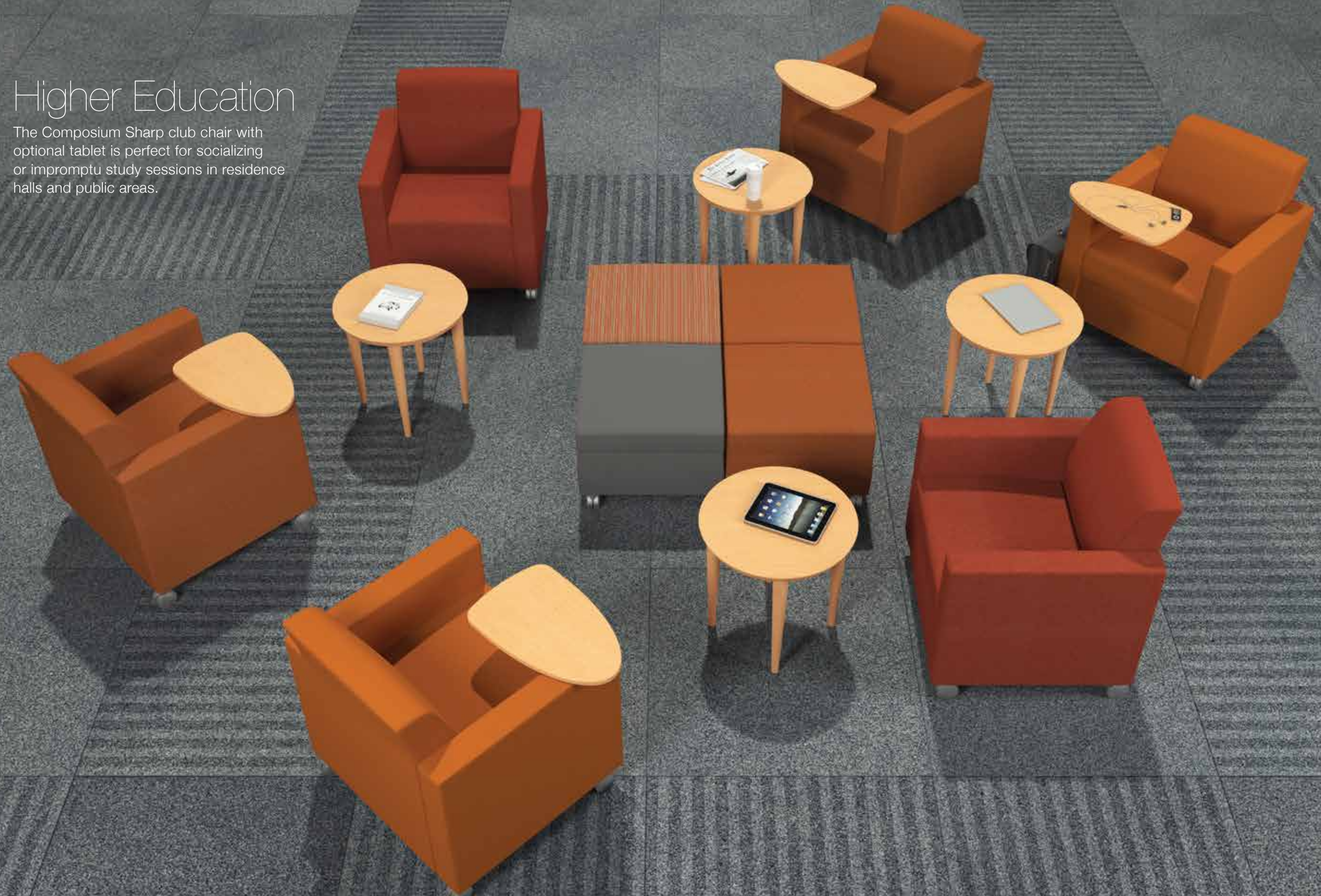
Compositum Sharp clubs with tablet in clear maple finish, round back, full valance, non-locking caster wheel in silver. TEXTILE: Momentum – Oath, Tango. Compositum Sharp clubs, round back, full valance, non-locking caster wheel in silver. TEXTILE: Maharam – Messenger, Satsuma. Compositum Ottomans, non-locking caster wheel in silver. TEXTILES: Momentum – Oath, Tango; DesignTex – Eastside, Little Italy; Momentum – Odyssey, Rue Mezzanine Occasional round tables in clear maple finish.

The Compositum Sharp club chair with optional tablet is perfect for socializing or impromptu study sessions in residence halls and public areas.