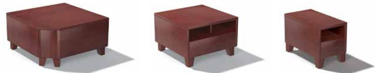
Cube Table Collection

Get in top shape with Mezzanine cube and occasional tables designed to complement Compositum seating.