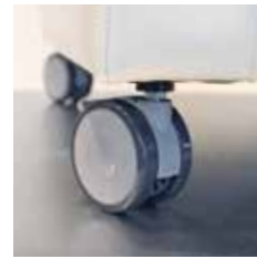
Locking Caster, Silver