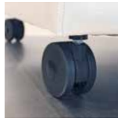
Non-Locking Caster, Black