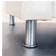
Metal 1.5" Pole, Brushed Steel