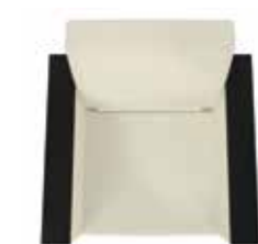
ARM CAP (available only with Composium Sharp and Composium Flair)