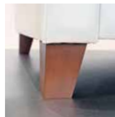
Wood Tapered Square