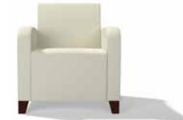
CURVE Shown with square back and integrated valance.