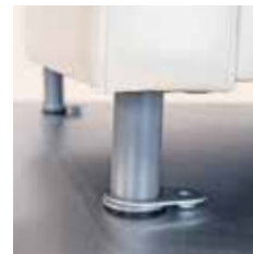
Metal 1.5" Pole Anchor, Silver Powder Coat