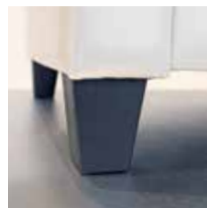
Standard Plastic, Black