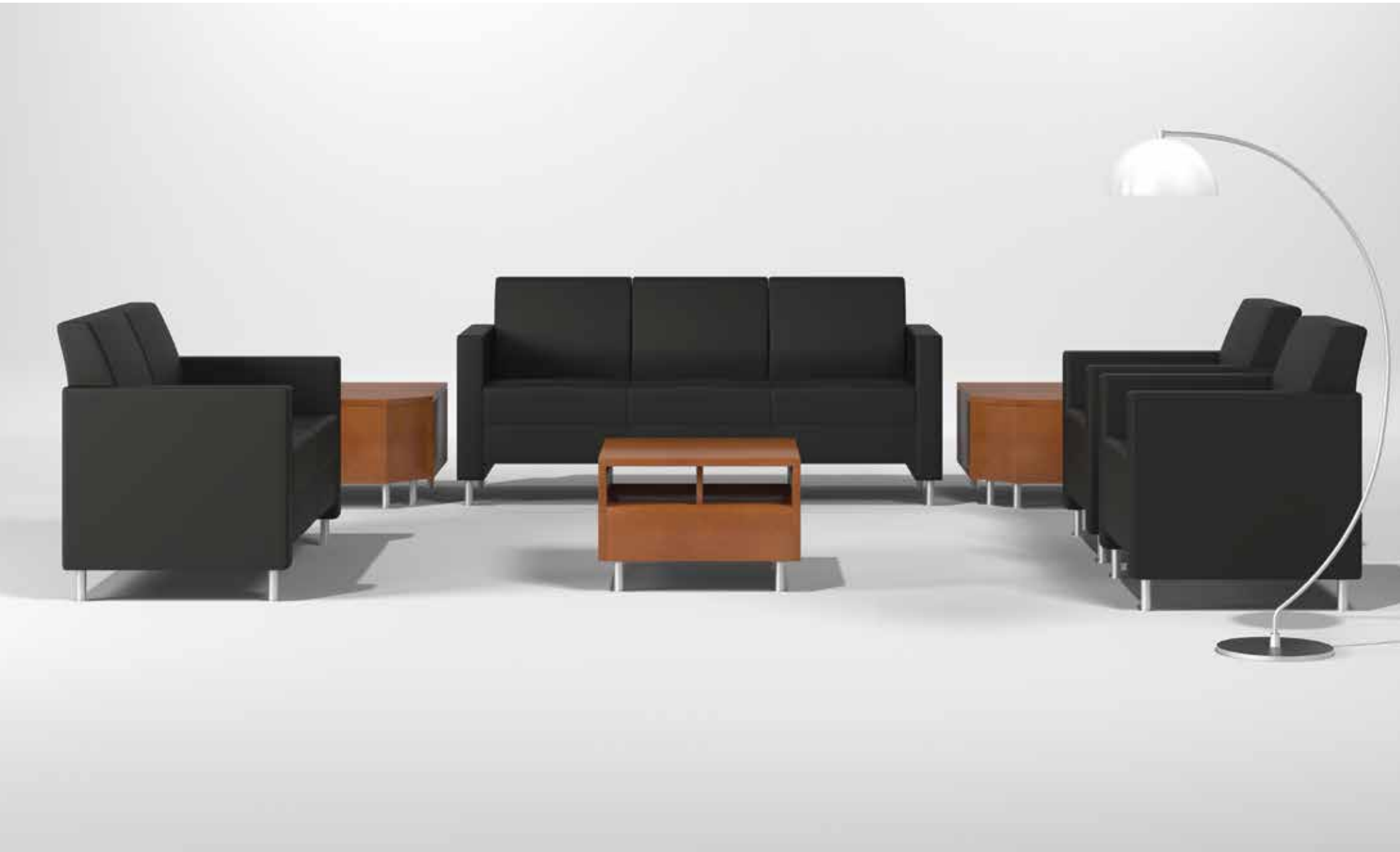
Composium Sharp settee, sofa and clubs, square back, 3/4 valance, metal 1.5" pole feet in brushed steel. TEXTILE: Green Hides – Rally, Black. Mezzanine Cube corner tables in medium cherry finish. Mezzanine cube coffee table in medium cherry finish.

Straight lines and minimalist styling make Composium Sharp a comfortable seating choice for industrial, formal setting or higher education settings.