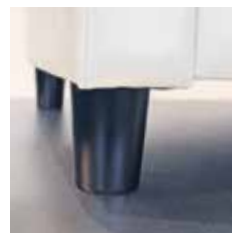
Wood Tapered Cylinder