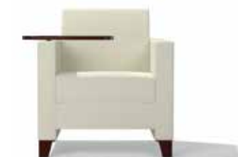
TABLET ARM (available only with Composium Sharp)