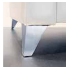
Metal Angular, Brushed Aluminum