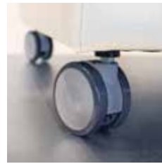
Non-Locking Caster, Silver