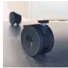
Locking Caster, Black