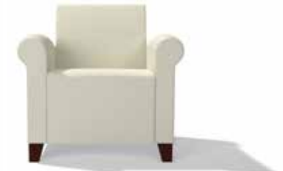
ROUND Shown with square back and integrated valance.