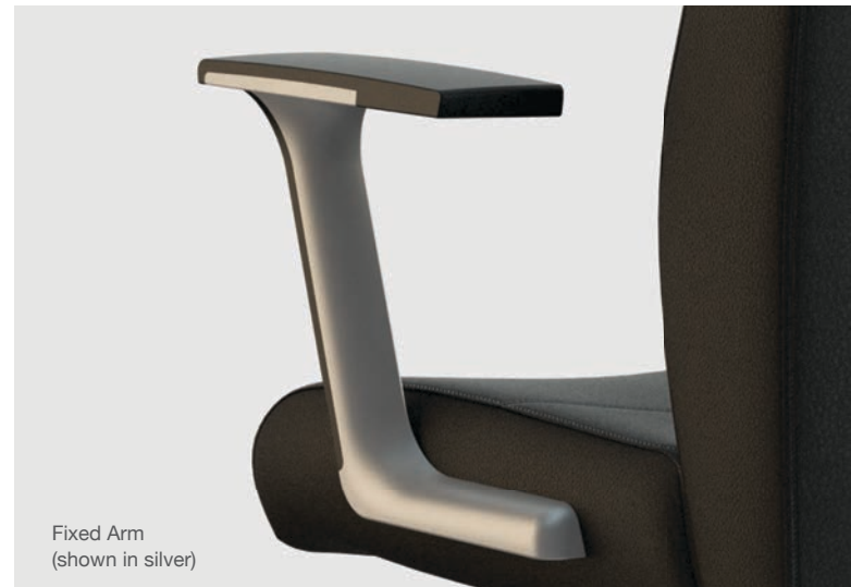
Fixed Arm (shown in silver)