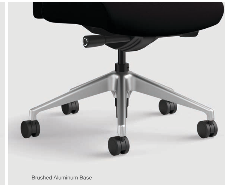
Brushed Aluminum Base