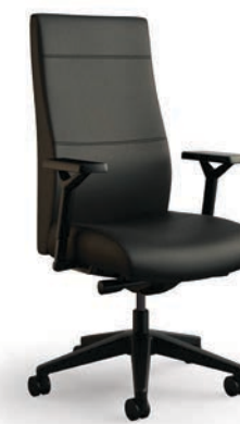
HIGHBACK TEXTILE: SitOnIt Collection Rally Espresso