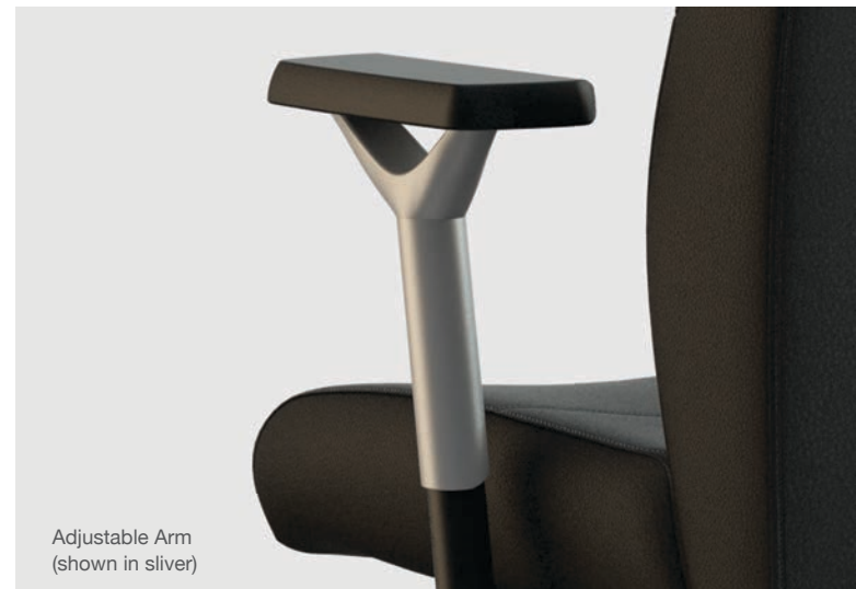
Adjustable Arm (shown in silver)