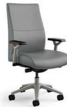
MIDBACK TEXTILE: Green Hides Sierra Mist