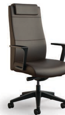
HIGHBACK (WITH HEADREST) TEXTILE: Green Hides Sierra Mahogany