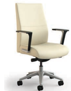
MIDBACK TEXTILE: Green Hides Lena Dover

Outfit Prava with a wide variety of textiles, from fabric to leather to vinyl. Zippers are now available in white for white and light-colored upholstery, as well as black.