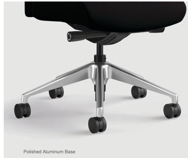
Polished Aluminum Base