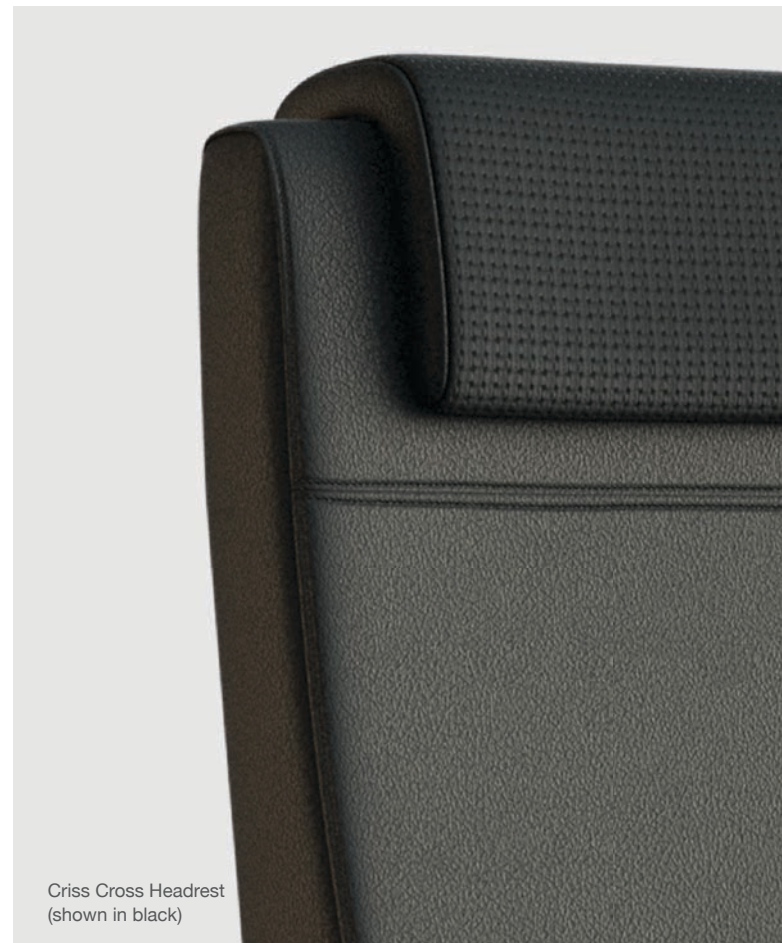
Criss Cross Headrest (shown in black)

Our Prava's mixed-media arm bears Pensi's signature, cast-aluminum design—the contemporary fusion of aluminum and plastic adds a subtly modern touch to any room.