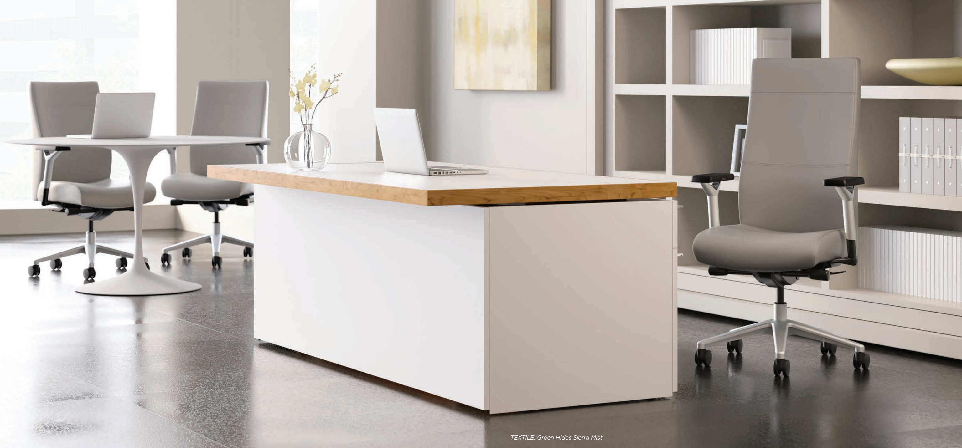
TEXTILE: Green Hides Sierra Mist