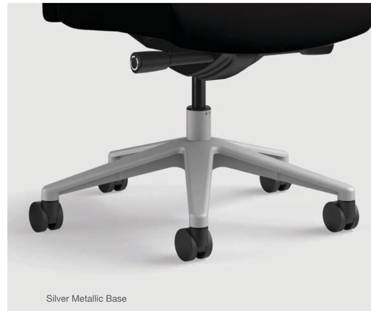
Silver Metallic Base